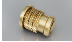
Type: BroachH (headed)