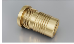
Type: FinH (headed)