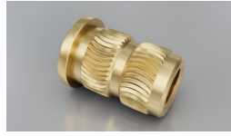
Type: HeatH (headed)