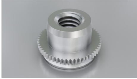
SF-FEX or SF-FEOX